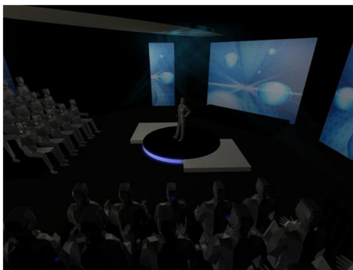
WMB for Arabic MTV—Mock-up of television set